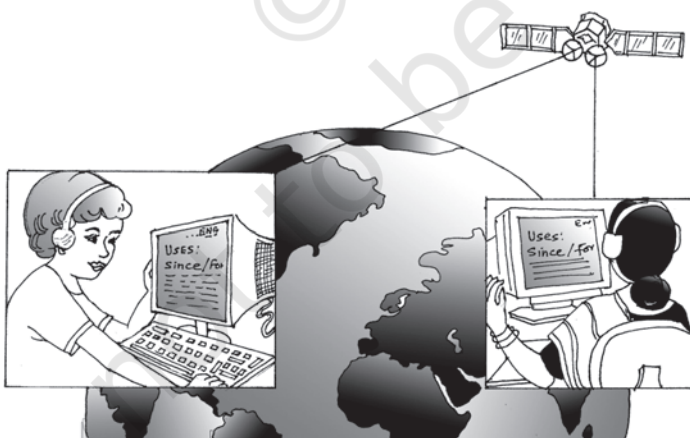
Fig. 3.1 Outsourcing: a new employment opportunity in big cities

global trade organisation to administer all multilateral trade agreements by providing equal opportunities to all countries in the international market for trading purposes. WTO is expected to establish a rule-based trading regime in which nations cannot place arbitrary restrictions on trade. In addition, its purpose is also to enlarge