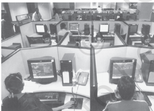
Fig. 3.2 IT industry is seen as a major contributor to India's exports

Some scholars question the usefulness of India being a member of the WTO as a major volume of international trade occurs among the developed nations. They also say that while developed countries file complaints over agricultural subsidies given in their countries, developing countries feel cheated as they are forced to open their markets for developed countries but are not allowed access to the markets of developed countries. What do you think?