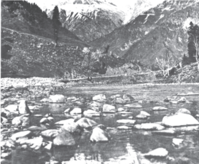
Fig. 9.1 Water bodies: small, snow-fed Himalayan streams are the few fresh-water sources that remain unpolluted.

this results in an environmental crisis. This is the situation today all over the world. The rising population of the developing countries and the affluent consumption and production standards of the developed world have placed a huge stress on the environment in terms of its first two functions. Many resources have become extinct and the wastes generated are beyond the absorptive capacity of the environment. Absorptive capacity means the ability of the environment to