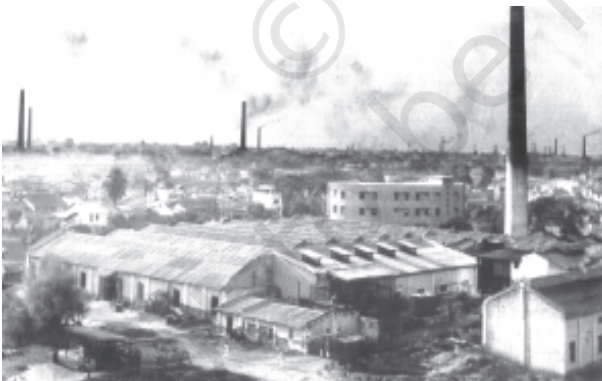
Fig. 9.2 Damodar Valley is one of India's most industrialised regions. Pollutants from the heavy industries along the banks of the Damodar river are converting it into an ecological disaster

But with population explosion and with the advent of industrial revolution to meet the growing needs of the expanding population, things changed. The result was that the demand for resources for both production and consumption went beyond the rate of regeneration of the resources; the pressure on the absorptive capacity of the environment increased tremendously — this trend continues even today. Thus what has happened is a reversal of supply-demand relationship for environmental quality — we are now faced with increased demand for environmental resources and services but their supply is limited due to overuse