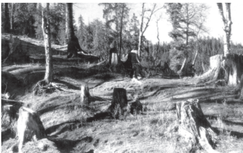
Fig. 9.3 Deforestation leads to land degradation, biodiversity loss and air pollution

India has abundant natural resources in terms of rich quality of soil, hundreds of rivers and tributaries, lush green forests, plenty of mineral deposits beneath the land surface, vast stretch of the Indian Ocean, ranges of mountains, etc. The black soil of the Deccan Plateau is particularly suitable for cultivation of cotton, leading to concentration of textile industries in this region. The Indo-Gangetic plains — spread from the Arabian Sea to the Bay of Bengal — are one of the most fertile, intensively cultivated and densely populated regions in the world. India's forests, though unevenly distributed, provide green cover for a majority of its population and natural cover for its wildlife. Large deposits of iron-ore, coal and natural gas are found in the country. India alone accounts for nearly 20 per cent of the world's total iron-ore reserves. Bauxite, copper, chromate, diamonds, gold, lead, lignite, manganese, zinc, uranium, etc. are also available in different parts of the country. However, the developmental activities in India have resulted in