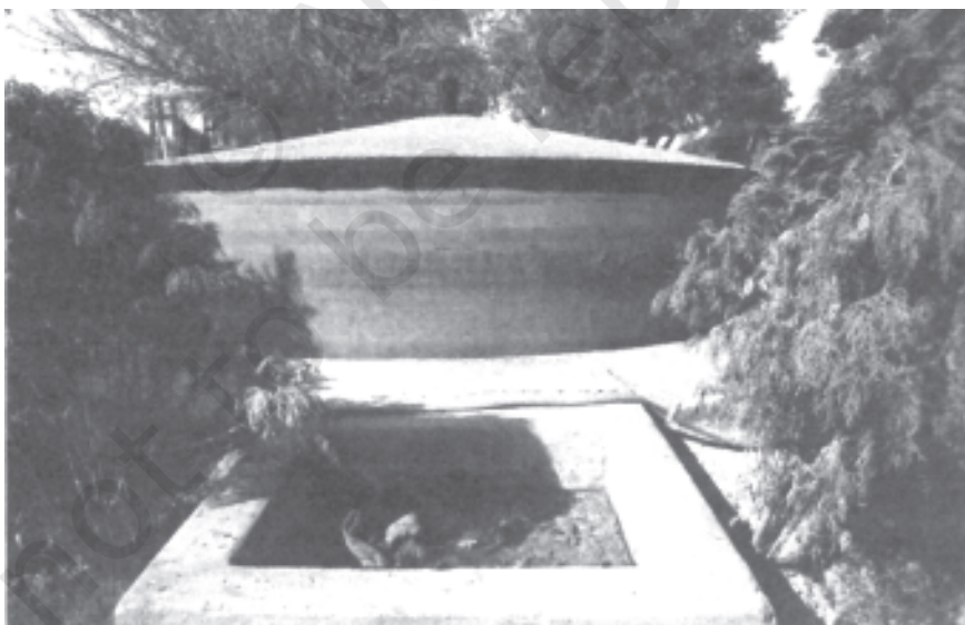
Fig.9.4 Gobar Gas Plant uses cattle dung to produce energy

Wind Power: In areas where speed of wind is usually high, wind mills can provide electricity without any adverse impact on the environment. Wind turbines move with the wind and electricity is generated. No doubt, the initial cost is high. But the benefits are such that the high cost gets easily absorbed.