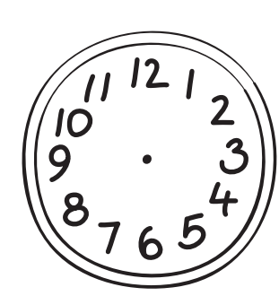
Sleep at night