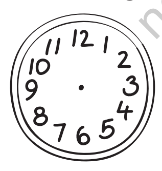
Sit down to study at home