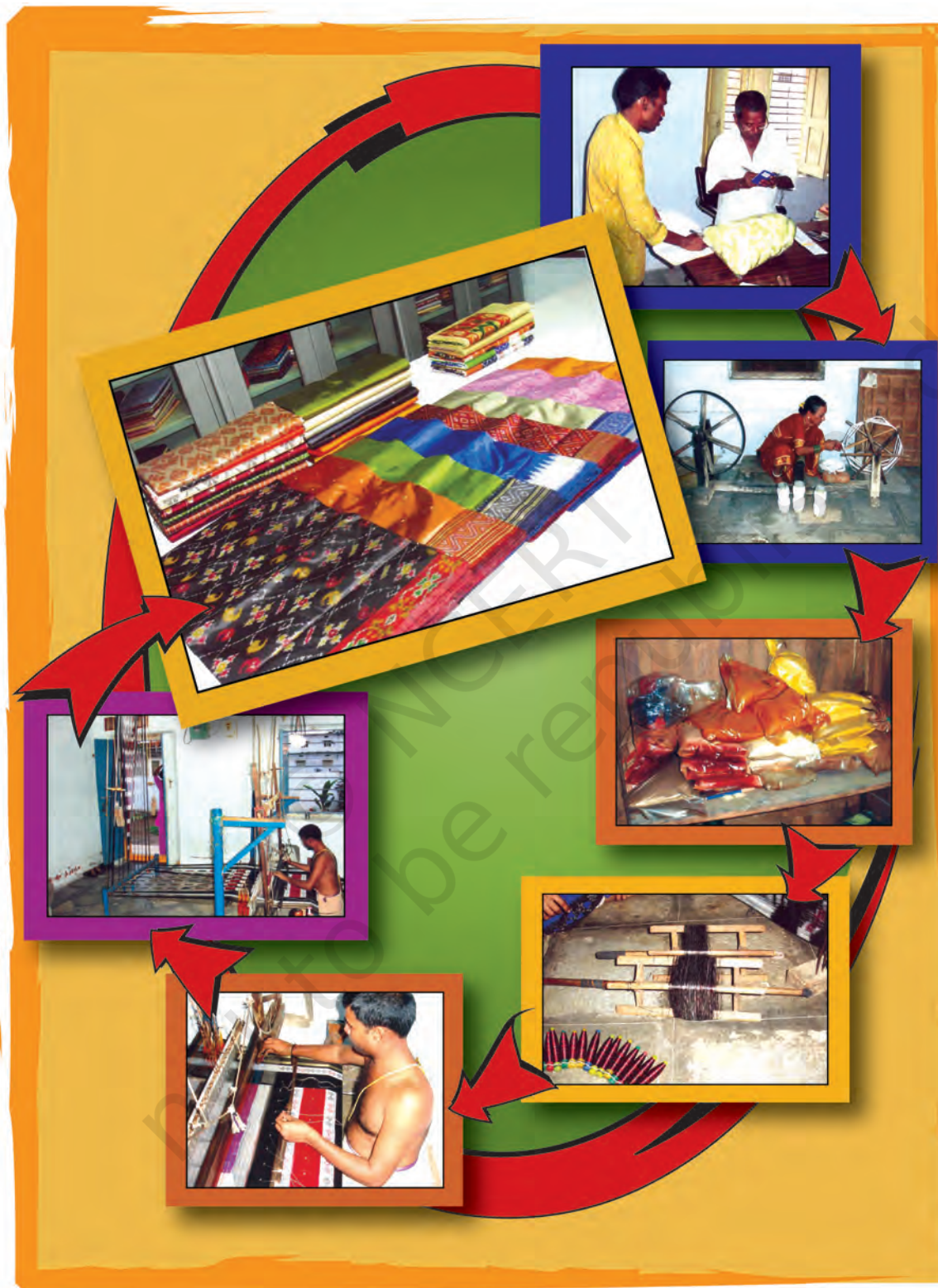
Process of making pochampalli sarees