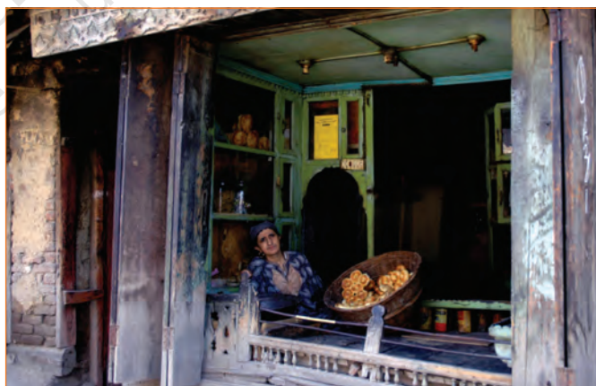
Can you tell what is shown in this picture? Every lane in Kashmir has a bakery. Kashmiri people don't cook roties in their homes, they buy it from such bakeries.

After a long journey Loner and I were about to reach Mumbai. My heart felt heavy. I also felt that my motorcycle did not want to come back. I was happy that I had learnt and experienced so many new things. I had also brought back some memories in my camera. And of course, this was not the end! Next time when Loner and I get bored of the city, we will again set out for a new journey!