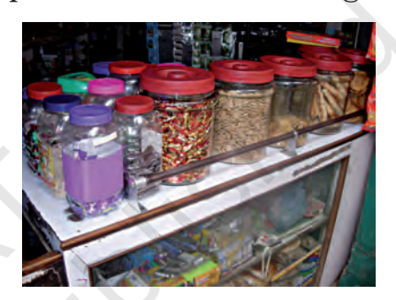
Fig. 4.8 Transparent bottles in a shop

hide behind a glass window? Obviously not, as your friends can see through that and spot you. Can you see through all the materials? Those substances or materials, through which things can be seen, are called transparent (Fig. 4.7). Glass, water, air and some plastics are examples of transparent materials. Shopkeepers usually prefer to keep biscuits, sweets and other eatables in transparent containers of glass or