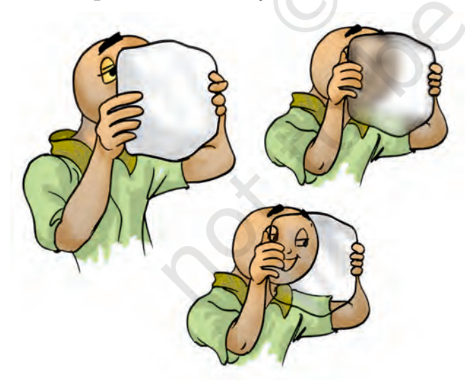
Fig. 4.7 Looking through opaque, transparent or translucent material

You might have played the game of hide and seek. Think of some places where you would like to hide so that you are not seen by others. Why did you choose those places? Would you have tried to