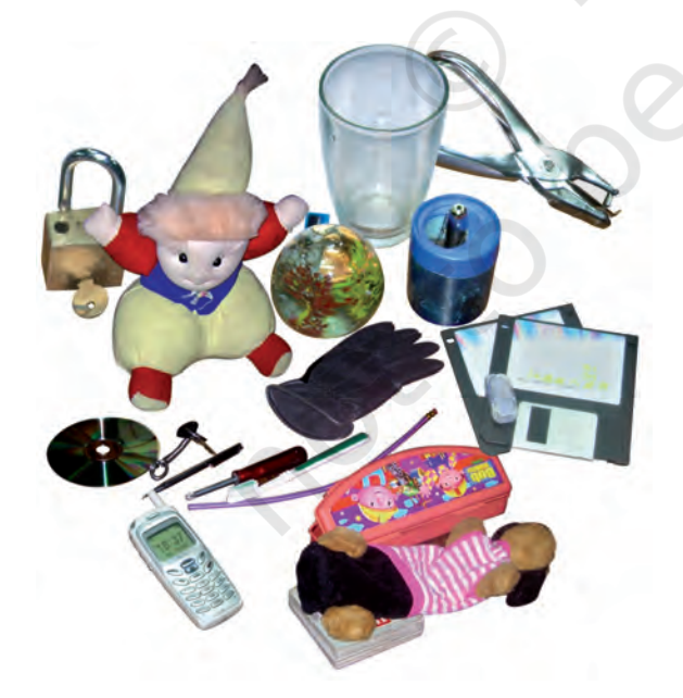
Fig. 4.1 Objects around us

Look around and identify objects that are round in shape. Our list may include a rubber ball, a football and a glass marble. If we include objects that are nearly round, our list could also include objects like apples, oranges, and an earthen pitcher ( gharha ). Suppose