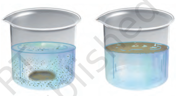
Fig. 4.4 What disappears, what doesn't?

beakers. Fill each one of them about twothirds with water. Add a small amount (spoonful) of sugar to the first glass, salt to the second and similarly, add small amounts of the other substances into the other glasses. Stir the contents of each of them with a spoon. Wait for a few minutes. Observe what happens to the substances added to water (Fig. 4.4). Note your observations as shown in Table 4.3.