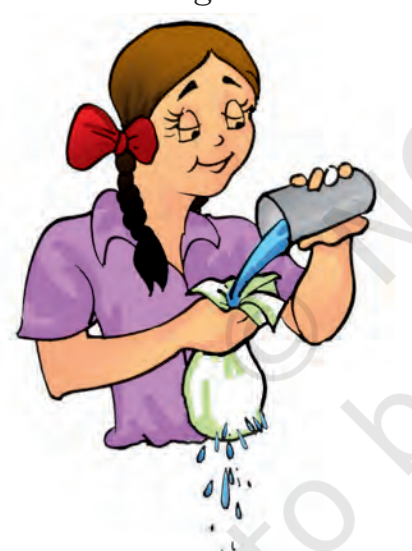
Fig. 4.2 Using a cloth tumbler

Have you ever wondered why a tumbler is not made with a piece of cloth? Recall our experiments with pieces of cloth in Chapter 3 and also keep in mind that we generally use a tumbler to keep a liquid. Therefore, would it not be silly, if we were to make a tumbler out of cloth (Fig 4.2)! What we need for a tumbler is glass, plastics, metal or other such material that will hold water. Similarly, it would not be wise to use paper-like materials for cooking vessels.