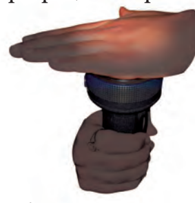
Fig. 4.9 Does torch light pass through your palm?

We can therefore group materials as opaque, transparent and translucent.