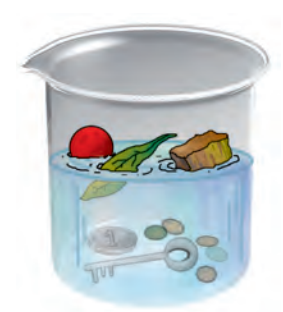
Figure 4.6 Some objects float in water while others sink in it

drops of honey that you let fall into a glass of water. What happens to all of these?