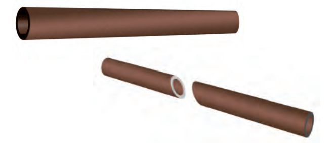
Fig. 4.3 Cutting pieces of materials to see if they have lustre

Do you notice such a shine or lustre in the other materials, cut them anyway as you can? Repeat this in the class with as many materials as possible and make a list of those with and without lustre. Instead of cutting, you can rub the surface of material with sand paper to see if it has lustre.