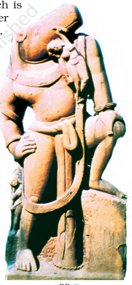
TRADERS, KINGS AND PILGRIMS

Vishnu as Varaha — an image from Eran, Madhya Pradesh. This magnificent statue is of a special form of Vishnu, the Varaha or boar. According to the Puranas (see Chapter 11) Vishnu took the shape of a boar in order to rescue the earth, which had sunk into water. Here the earth is shown as a woman.