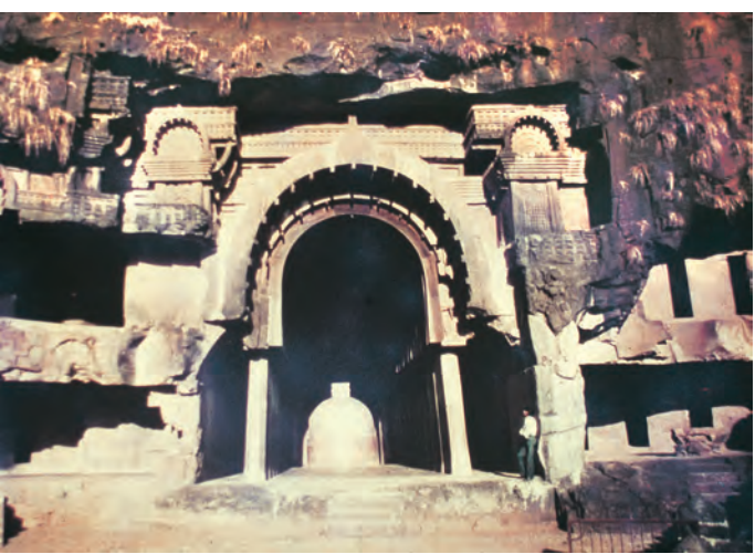
A cave at Karle, Maharashtra

Read page 100 once more. Can you think of how Buddhism spread to these lands?