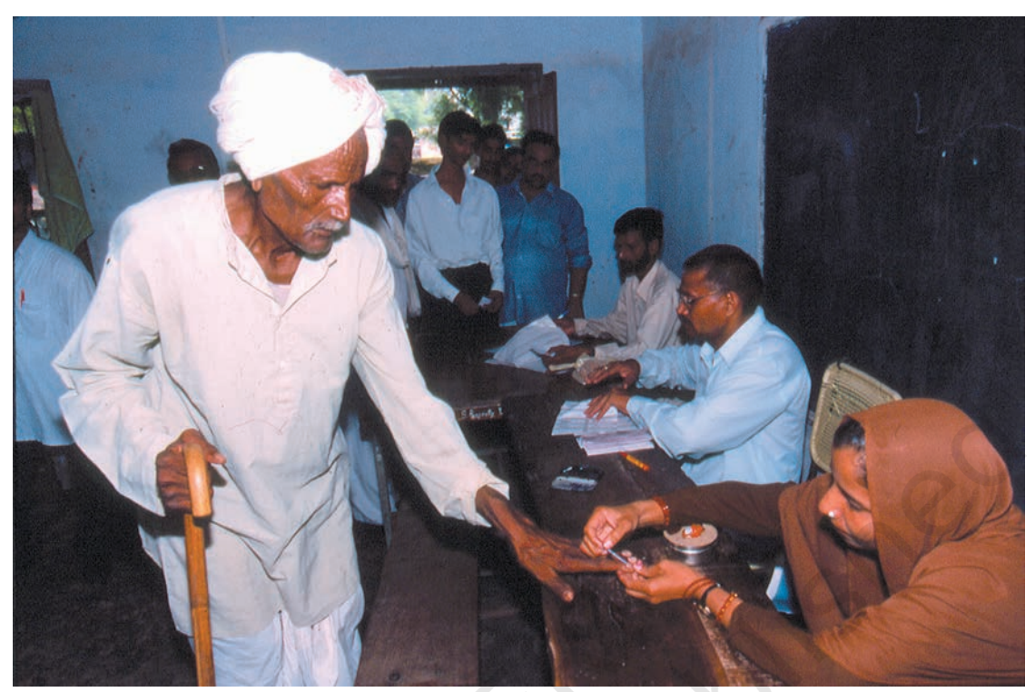
Voting in a rural area: A mark is put on the finger to make sure that a person casts only one vote.

decisions for the entire population. These days a government cannot call itself democratic unless it allows what is known as universal adult franchise. This means that all adults in the country are allowed to vote.