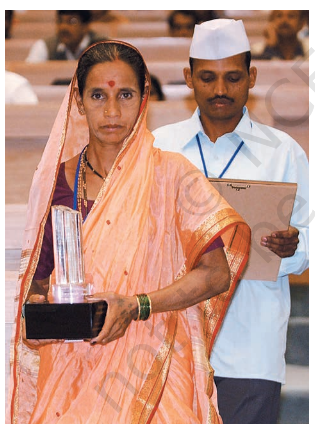
Two village Panchs from Maharashtra who were awarded the Nirmal Gram Puruskar in 2005 for the excellent work done by them in the Panchayat.

In some states, Gram Sabhas form committees like construction and development committees. These committees include some members of the Gram Sabha and some from the Gram Panchayat who work together to carry out specific tasks.