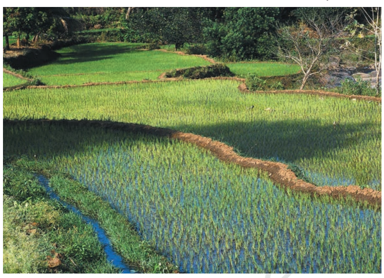
Transplanted paddy growing in a few of Ramalingam's 20 acres. A result of hard labour performed by agricultural workers like Thulasi.