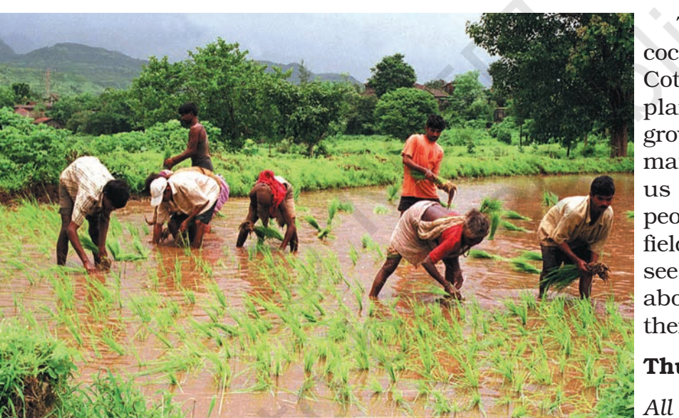
Transplanting paddy is back-breaking work.

The village is surrounded by low hills. Paddy is the main crop that is grown in irrigated lands. Most of the families earn a living through agriculture.