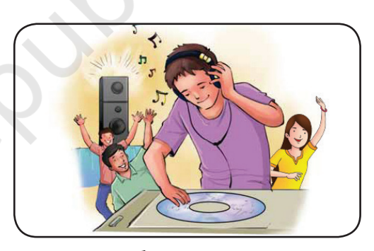
D. Loud music in a party