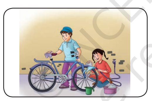
C. Washing bicycle with running water