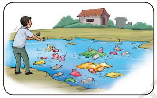
A. Throwing garbage in a water body