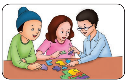
F. Working in a group

Discuss your comments/ideas in your class.