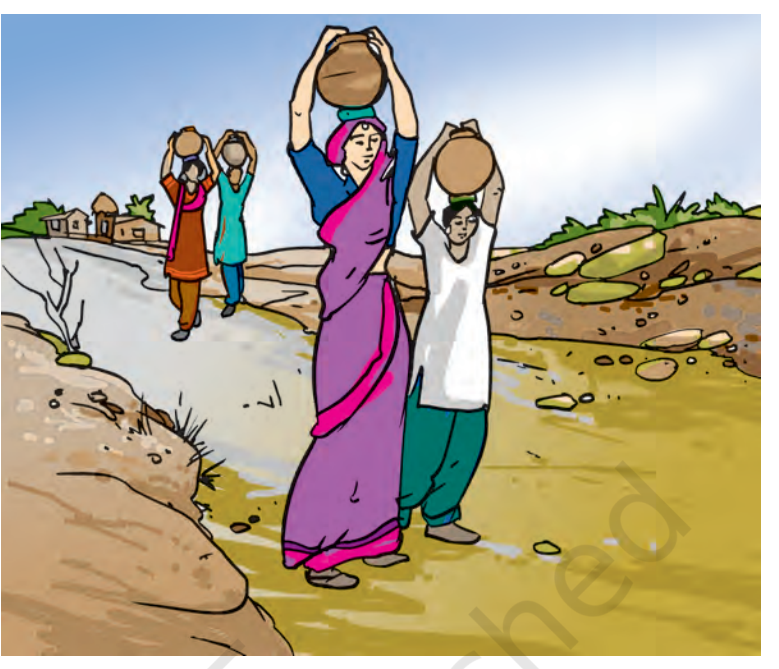
Fig. 16.6 Women fetching water

If we dig a hole in the ground near a water body we may find that the soil is moist. The moisture in the soil indicates the presence of water underground. If we dig deeper and deeper, we would reach a level where all the space between particles of soil and gaps between rocks are filled with water (Fig. 16.7). The upper level of this layer is called the water table . The water table varies from