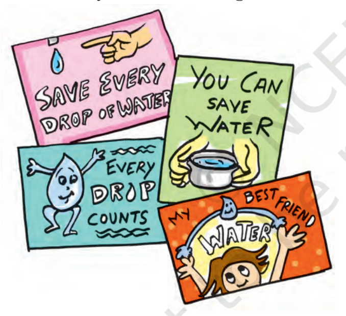
Fig. 16.1 Collage of posters

You are perhaps aware that 22 March is celebrated as the world water day ! A school celebrated 'water day' and invited posters from the children of your age group. Some of the posters presented on that day are shown in Fig. 16.1.