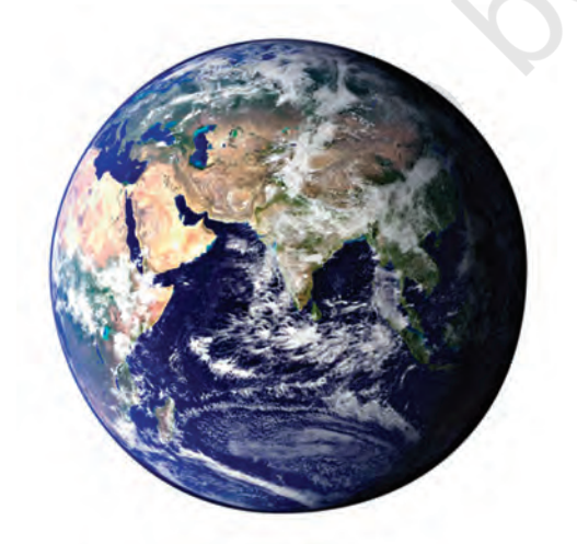
Fig. 16.4 Earth appears blue from space

Water shortage has become a matter of concern throughout the world. It is estimated that in a few years from now