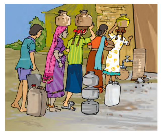
Fig. 16.2 Long queue for water