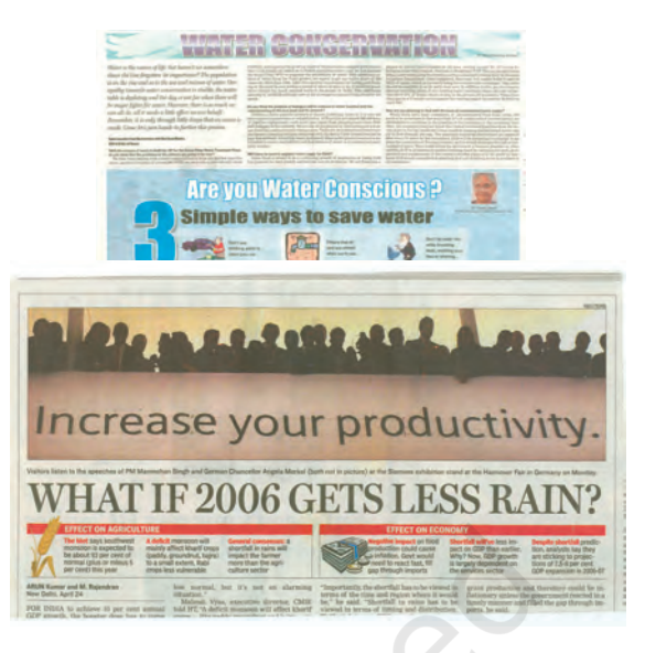
Fig. 16.3 Newspaper clippings

Year 2003 was observed as the International Year of Freshwater to make people aware of this dwindling natural resource.