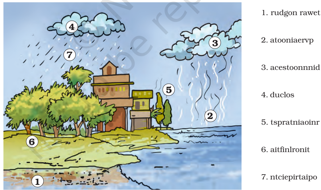
2. atooniaervp 3. acestoonnnid 4. duclos 5. tspratniaoinr 6. aitfinlronit 7. ntciepirtaipo

Most towns and cities have water supply system maintained by the civic