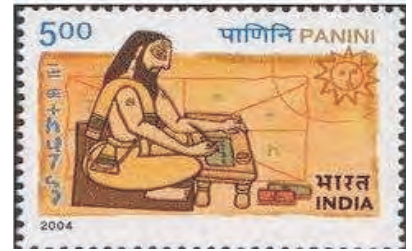
Postage stamp of Indian grammarian, Panini

Takshashila became famous as a place of learning due to its teachers' expertise. Among its noted pupils were the legendary Indian grammarian, Panini. He was an expert in language and grammar and authored one of the greatest works on grammar called Ashtadhyayi . Jivaka, one of the most renowned physicians in ancient India, and Chanakya (also known as Kautilya), a skilled exponent of statecraft, both studied here. Students came to Takshashila from Kashi, Kosala, Magadha and also from other countries in spite of the long and arduous journey they had to undertake.