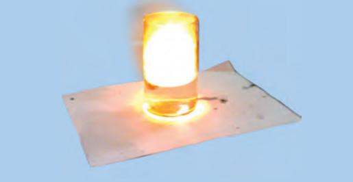
Fig. 4.5: Reaction of sodium with water

Take a 250 mL beaker/glass tumbler. Fill half of it with water. Now carefully cut a small piece of sodium metal. Dry it using filter paper and wrap it in a small piece of cotton. Put the sodium piece wrapped in cotton into the beaker. Observe carefully. (During observation keep away from the beaker). When reaction stops touch the beaker. What do you feel? Has the beaker become hot? Test the solution with red and blue litmus papers. Is the solution acidic or basic?