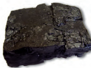
Fig. 5.1: Coal

You may have seen coal or heard about it (Fig. 5.1). It is as hard as stone and is black in colour.