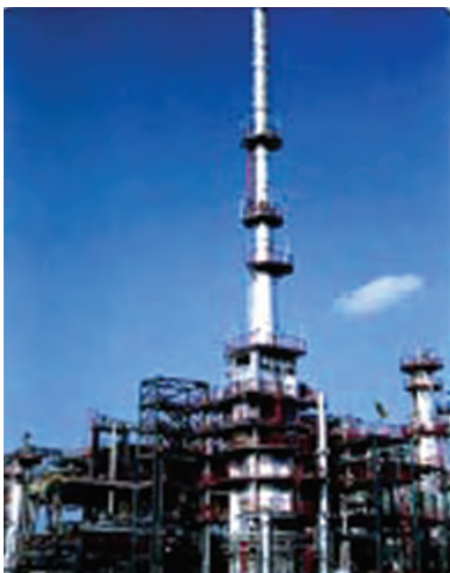
Fig. 5.5: A petroleum refinery

separating the various constituents/fractions of petroleum is known as refining. It is carried out in a petroleum refinery (Fig. 5.5).