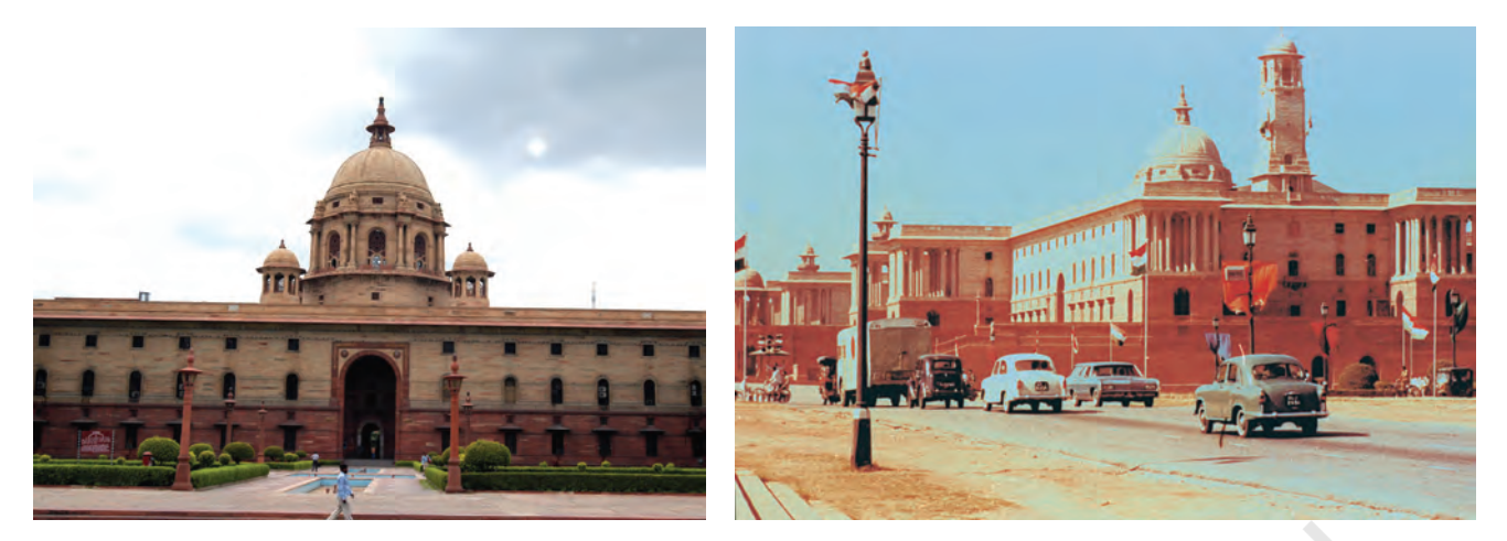
These two buildings of the Central Secretariat, the South Block and North Block were built during the 1930s. The photo on the left is of the South Block which houses the Prime Minister's Office (PMO), the Ministry of Defence and the Ministry of External Affairs. The North Block is the photo on the right and this has the Ministry of Finance and the Ministry of Home Affairs. The other ministries of the Union Government are located in various buildings in New Delhi.

The Rajya Sabha functions primarily as the representative of the states of India in the Parliament. The Rajya Sabha can also initiate legislation and a bill is required to pass through the Rajya Sabha in order to become a law. It, therefore, has an important role of reviewing and altering (if alterations are needed) the laws initiated by the Lok Sabha. The members of the Rajya Sabha are elected by the elected members of the Legislative Assemblies of various states. There are 233 elected members plus 12 members nominated by the President.