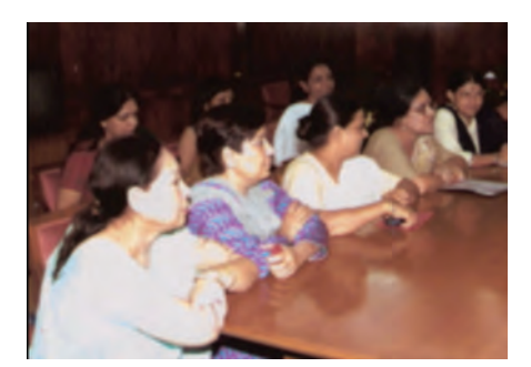
The above photo shows a few women Members of Parliament.

Why do you think there are so few women in Parliament? Discuss.