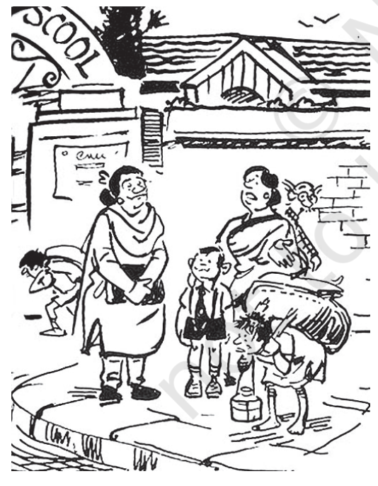
It's really cruel burdening kids like this. I had to hire that boy to help my son!

10. What do you think the famous cartoonist R.K. Laxman is trying to convey in this cartoon? How does it relate to the 2016 law that you read about on page 123?