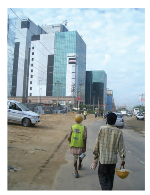
Accidents are common to construction sites. Yet, very often, safety equipment and other precautions are ignored.