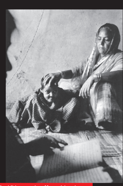
A child severely affected by the gas

Most of those exposed to the poison gas came from poor, working-class families, of which nearly 50,000 people are today too sick to work. Among those who survived, many developed severe respiratory disorders, eye problems and other disorders. Children developed peculiar abnormalities, like the girl in the photo.