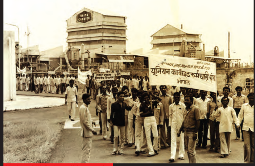
The disaster was not an accident. UC had deliberately ignored the essential safety measures in order to cut costs. Much before the Bhopal disaster, there had been incidents of gas leak killing a worker and injuring several.