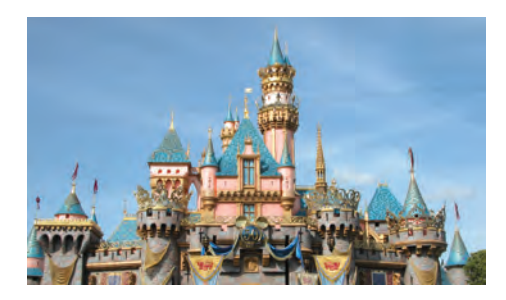
Recently a large travel agency was asked to pay Rs 8 lakh as compensation to a group of tourists. Their foreign trip was poorly managed and they missed Disneyland and shopping in Paris. Why did the victims of Bhopal gas tragedy then get so little for a lifetime of misery and pain?

Can you point to a few other situations where laws (or rules) exist but people do not follow them because of poor enforcement? (For example, over-speeding by motorists, not wearing helmet/seat belt and use of mobile phone while driving). What are the problems in enforcement? Can you suggest some ways in which enforcement can be improved?