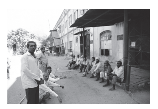
Workers outside closed factories. Thrown out of work, many of the workers end up as small traders or as daily-wage labourers. Some might find work in even smaller production units, where the conditions of work are even more exploitative and the enforcement of laws weaker.

Emissions from vehicles are a major cause of environmental pollution. In a series of rulings (1998 onwards), the Supreme Court had ordered all public transport vehicles using diesel were to switch to Compressed Natural Gas (CNG). As a result of this move, air pollution in cities like Delhi came down considerably. But a recent report by the Center for Science and Environment, New Delhi, shows the presence of high levels of toxic substance in the air. This is due to emissions from cars run on diesel (rather than petrol) and a sharp increase in the number of cars on the road.