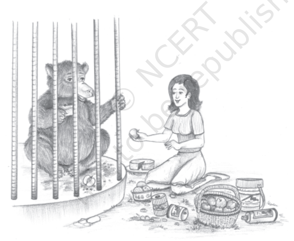
For the next three hours she would not leave that cage ...