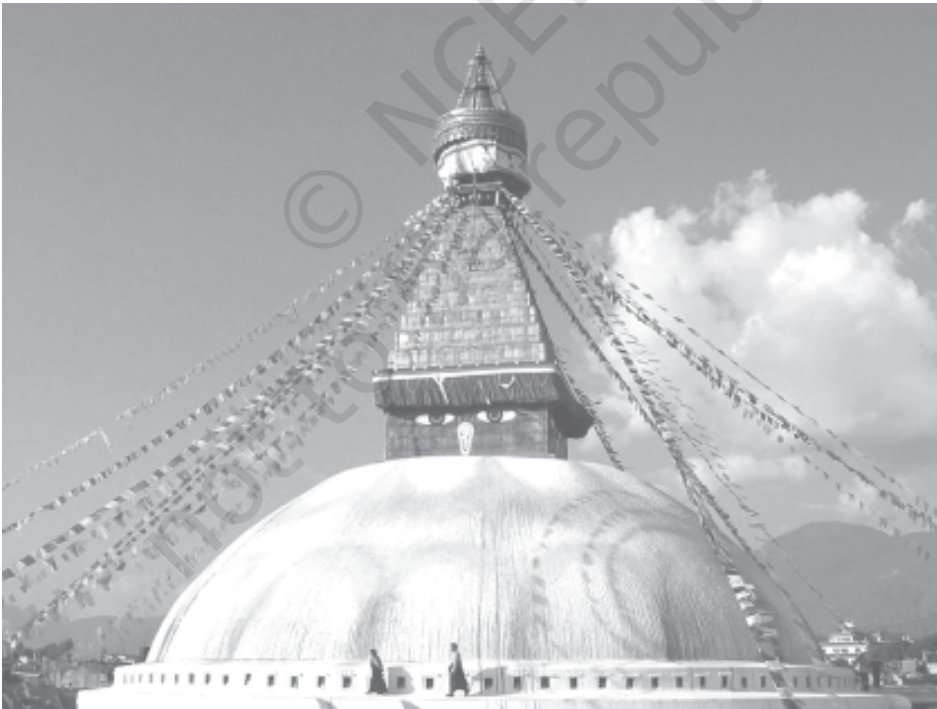
The Baudhnath Stupa, Kathmandu

4. Kathmandu is vivid, mercenary, religious, with small shrines to flower-adorned deities along the narrowest and busiest streets; with fruit sellers, flute sellers, hawkers of postcards; shops selling Western cosmetics, film rolls and chocolate; or copper utensils and Nepalese antiques. Film songs blare out from the radios, car horns sound, bicycle bells ring, stray cows low questioningly at motorcycles, vendors shout out their wares. I indulge