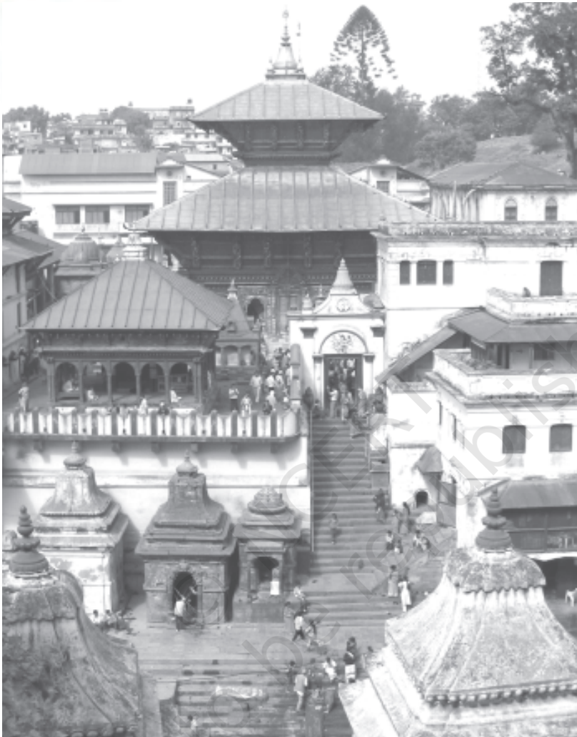
Pashupatinath Temple, Kathmandu

that flows below. A corpse is being cremated on its banks; washerwomen are at their work and children bathe. From a balcony a basket of flowers and leaves, old offerings now wilted, is dropped into the river. A small shrine half protrudes from the stone platform on the river bank. When it emerges fully, the goddess inside will escape, and the evil period of the Kaliyug will end on earth.