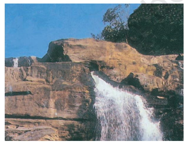
Figure 2.6 : A Waterfall in Chotanagpur Plateau

The Peninsular plateau is a tableland composed of the old crystalline, igneous and metamorphic rocks. It was formed due to the breaking and drifting of the Gondwana land and thus, making it a part of the oldest landmass. The plateau has broad and shallow valleys and rounded hills. This plateau consists of two broad divisions, namely, the Central Highlands and the Deccan Plateau. The part of the Peninsular plateau lying to the north of the Narmada river, covering a major area of the Malwa plateau, is known as the Central Highlands. The Vindhyan range is bounded by the Satpura range on the south and the Aravalis on the northwest. The further westward extension gradually merges with the sandy and rocky desert of Rajasthan. The flow of the rivers draining this region, namely the Chambal, the Sind, the Betwa and the Ken is from southwest to northeast, thus indicating the slope. The Central Highlands are wider in the west but narrower in the east. The eastward extensions of this plateau are locally known as the Bundelkhand and Baghelkhand.