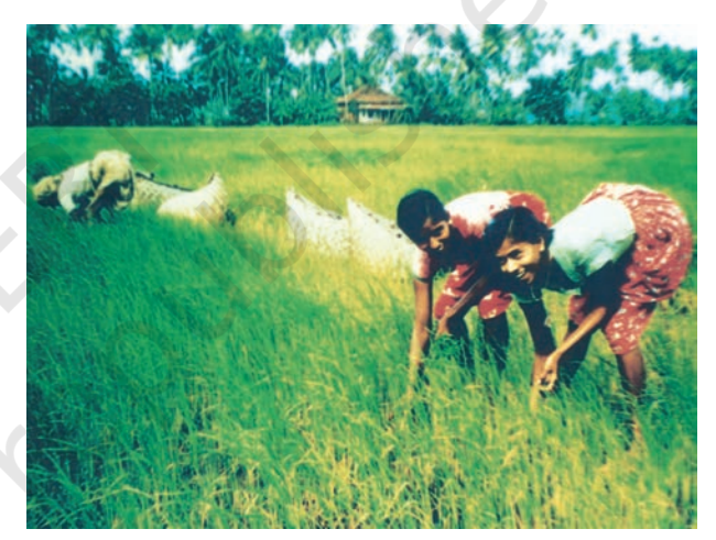
Figure 2.8 : The Coastal Plains

The Peninsular plateau is flanked by stretch of narrow coastal strips, running along the Arabian Sea on the west and the Bay of Bengal on the east . The western coast , sandwiched between the Western Ghats and the Arabian Sea, is a narrow plain. It consists of three sections. The northern part of the coast is called the Konkan (Mumbai – Goa), the central stretch is called the Kannad Plain , while the southern stretch is referred to as the Malabar coast .