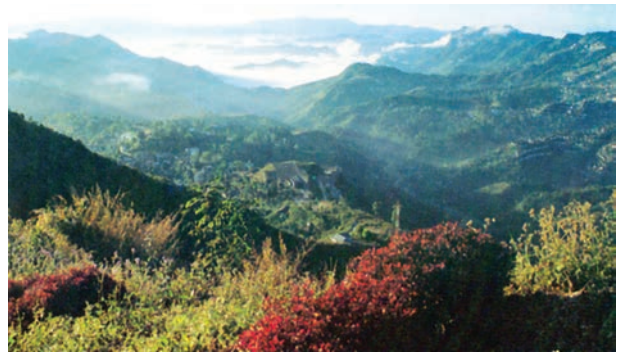
Figure 2.4 : Mizo Hills

The Brahmaputra marks the eastern-most boundary of the Himalayas. Beyond the Dihang gorge, the Himalayas bend sharply to the south and spread along the eastern boundary of India. They are known as the Purvachal or the Eastern hills and mountains. These hills running through the north-eastern states are mostly composed of strong sandstones, which are sedimentary rocks. Covered with dense forests, they mostly run as parallel ranges and valleys. The Purvachal comprises the Patkai hills , the Naga hills , the Manipur hills and the Mizo hills.