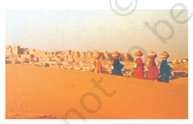
Figure 2.7 : The Indian Desert

The Indian desert lies towards the western margins of the Aravali Hills. It is an undulating sandy plain covered with sand dunes. This region receives very low rainfall below 150 mm per year. It has arid climate with low vegetation cover. Streams appear during the rainy season. Soon after they disappear into the sand as they do not have enough water to reach the sea. Luni is the only large river in this region.