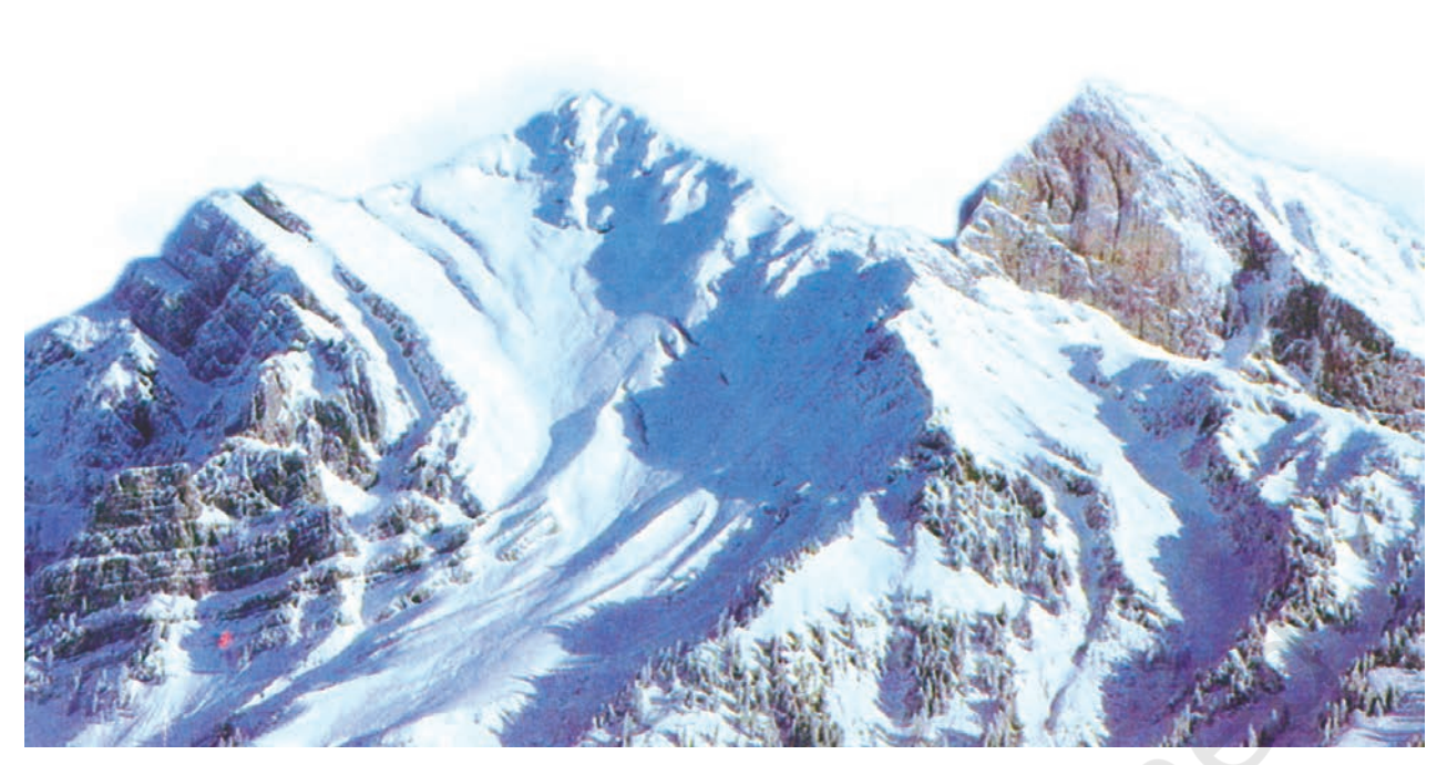
Figure 2.3 : The Himalayas

of 10-50 Km and have an altitude varying between 900 and 1100 metres. These ranges are composed of unconsolidated sediments brought down by rivers from the main Himalayan ranges located farther north. These valleys are covered with thick gravel and alluvium. The longitudinal valley lying between lesser Himalaya and the Shiwaliks are known as Duns. Dehra Dun, Kotli Dun and Patli Dun are some of the well-known Duns.