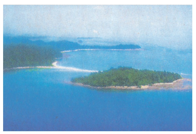
Figure 2.9 : An Island

You have already seen that India has a vast mainland. Besides this, the country has two groups of islands. Can you identify these island groups?