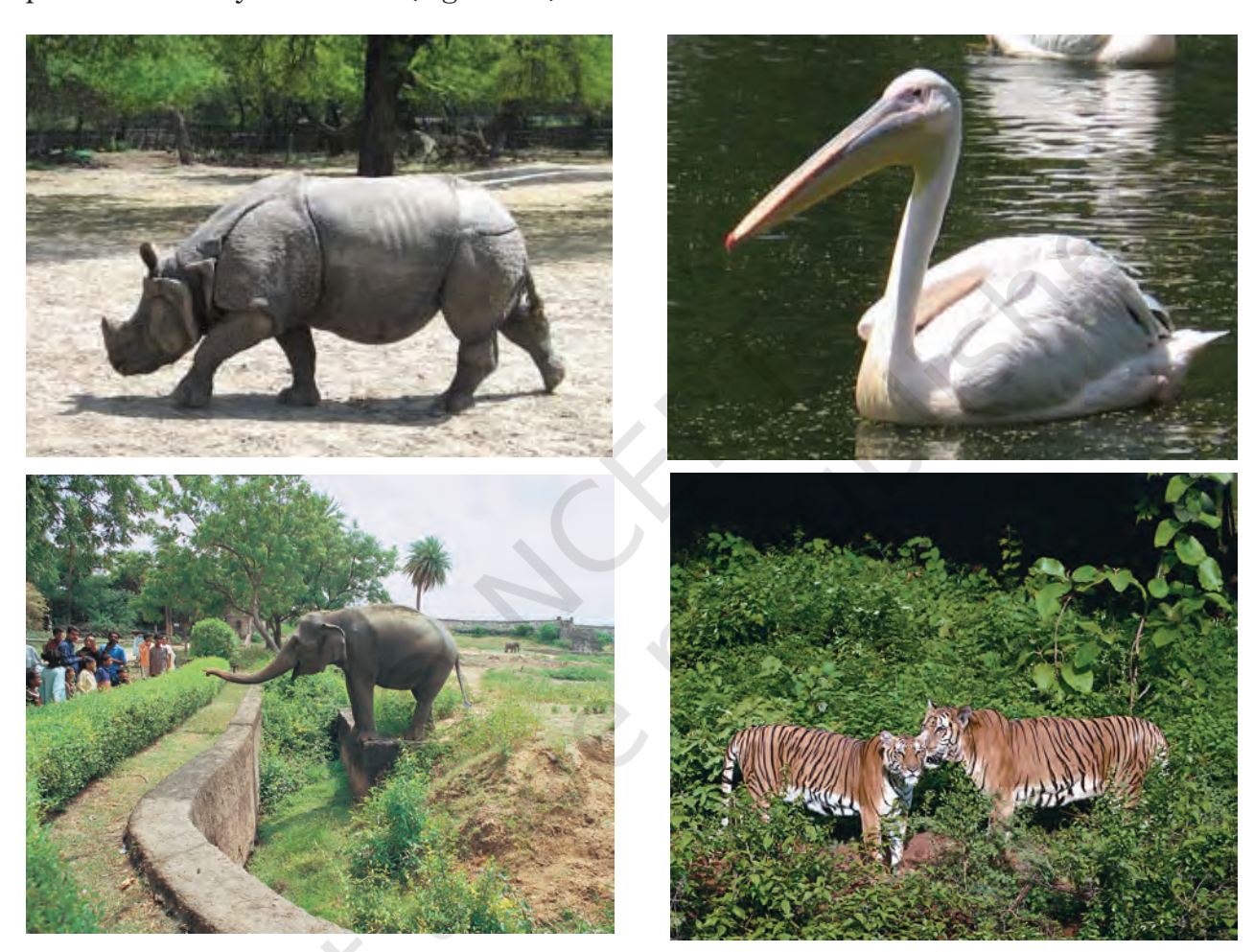
Figure 1.3 Pictures showing animals in different zoological parks of India

These are the places where wild animals are kept in protected environments under human care and which enable us to learn about their food habits and behaviour. All animals in a zoo are provided, as far as possible, the conditions similar to their natural habitats. Children love visiting these parks, commonly called Zoos (Figure 1.3).