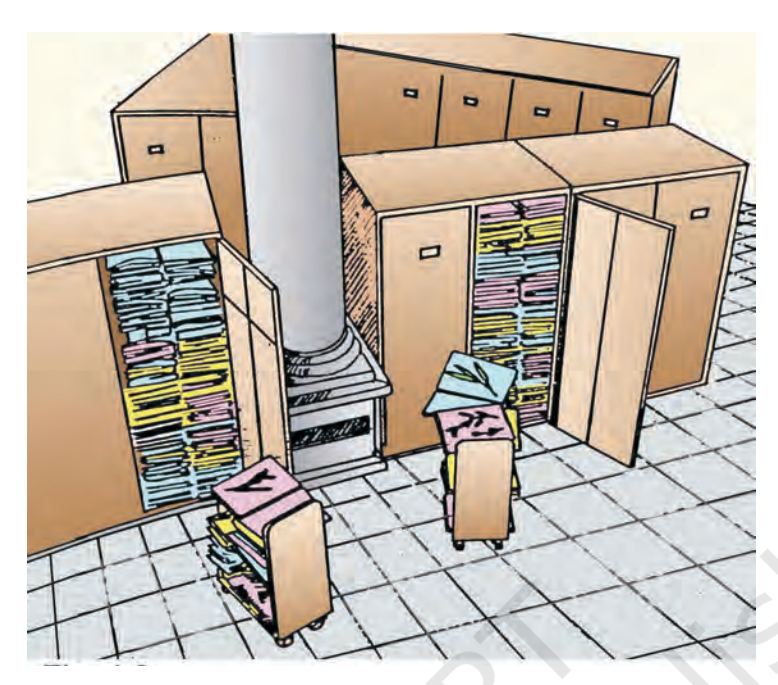
Figure 1.2 Herbarium showing stored specimens

according to a universally accepted system of classification. These specimens, along with their descriptions on herbarium sheets, become a store house or repository for future use (Figure 1.2). The herbarium sheets also carry a label providing information about date and place of collection, English, local and botanical names, family, collector's name, etc. Herbaria also serve as quick referral systems in taxonomical studies.