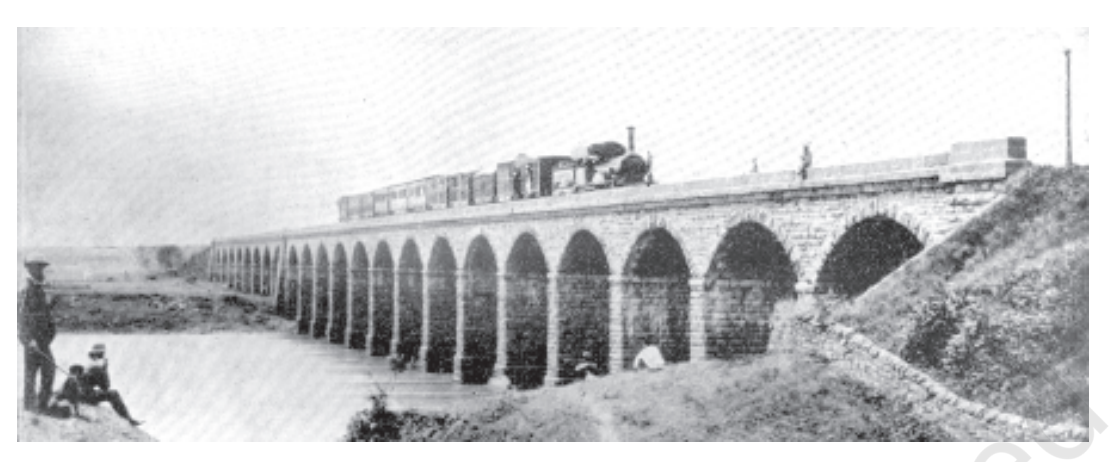
Fig. 1.4 First Railway Bridge linking Bombay with Thane, 1854

Indian people gained owing to the introduction of the railways, were thus outweighed by the country's huge economic loss.