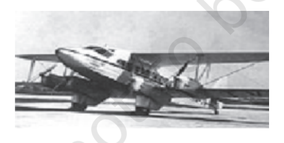
Fig.1.5 Tata Airlines, a division of Tata and Sons, was established in 1932 inaugurating the aviation sector in India

Along with the development of roads and railways, the colonial dispensation also took measures for developing the inland trade and sea lanes. However, these measures were far from satisfactory. The inland waterways, at times, also proved uneconomical as in the case of the Coast Canal on the Orissa coast. Though the canal was built at a huge