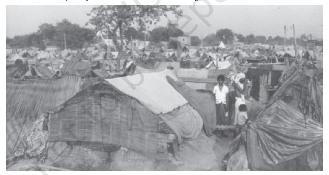
Fig. 1.3 A large section of India's population did not have basic needs such as housing

During the colonial period, the occupational structure of India, i.e., distribution of working persons across different industries and sectors, showed little sign of change. The agricultural sector accounted for