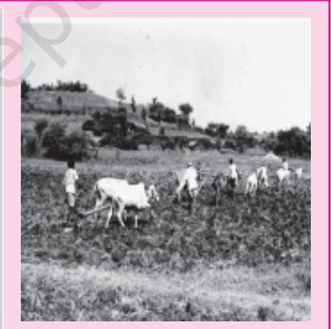
Fig. 1.1 India's agricultural stagnation under the British colonial rule

India's economy under the British colonial rule remained fundamentally agrarian — about 85 per cent of the country's population lived mostly in villages and derived livelihood directly or indirectly from agriculture. However, despite being the occupation of such a large population, the agricultural sector