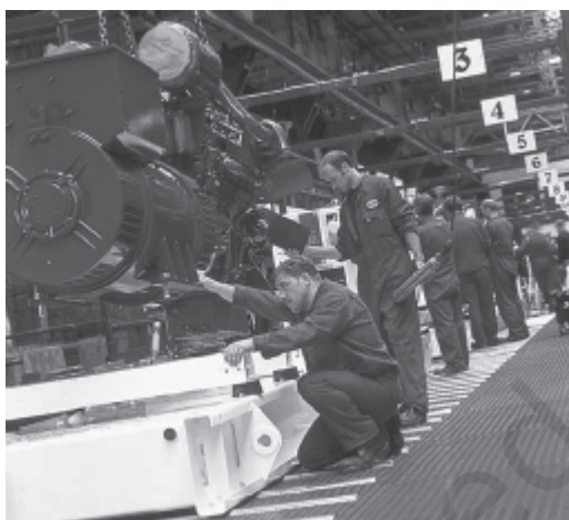
Fig. 5.3 Scientific and technical manpower: a rich ingredient of human capital

Empirical evidence to prove that increase in human capital causes economic growth is rather nebulous. This may be because of measurement problems. For example, education measured in terms of years of schooling, teacher-pupil ratio and enrolment rates may not reflect the quality of education; health services measured in monetary terms, life expectancy and mortality rates may not reflect the true health status of the people in a country. Using the indicators mentioned above, an analysis of improvement in education and health sectors and growth in real per capita income in both developing and developed countries shows that there is convergence in the measures of human capital but no sign of convergence of per capita real income. In other words, the human capital growth in developing countries has been faster but the growth of per capita real income has not been that fast. There are reasons to believe that the