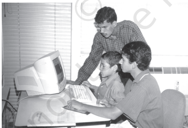
Fig. 5.4 Job on hand: transforming India into a knowledge economy

among four major growth centres in the world by the year 2020. It further states, "Our empirical investigation supports the view that human capital is the most important factor of production in today's economies. Increases in human capital are crucial to achieving increases in GDP." With reference to India it states, "Between 2005 and 2020 we expect a 40 per cent rise in the average years of education in India, to just above 7 years..."