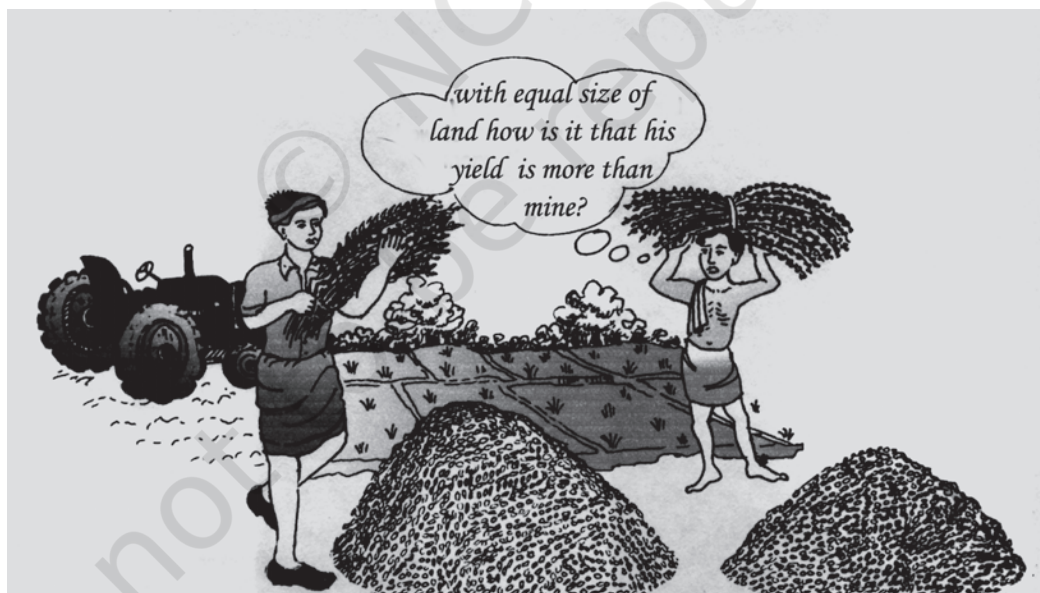
Fig. 5.1 Adequate education and training to farmers can raise productivity in farms

Education is sought not only as it confers higher earning capacity on people but also for its other highly valued benefits: it gives one a better social standing and pride; it enables one to make better choices in life; it provides knowledge to understand the changes taking place in society; it also stimulates innovations. Moreover, the availability of educated labour force facilitates adaptation of new