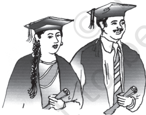
Fig. 5.7 Higher Education: few takers

The differences in literacy rates between males and females are narrowing signifying a positive development in gender equity; still the need to promote education for women in India is imminent for various reasons such as improving economic independence and social status of women and also because women education makes a favourable impact on fertility rate and health care of women and children. Therefore, we cannot be complacent about the upward movement in the literacy rates and we have miles to go in achieving cent per cent adult literacy.