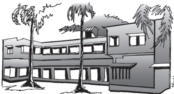
Fig. 5.5 Investment in educational infrastructure is inevitable

Pradesh to as low as Rs 4088 in Bihar. This leads to differences in educational opportunities and attainments across states.