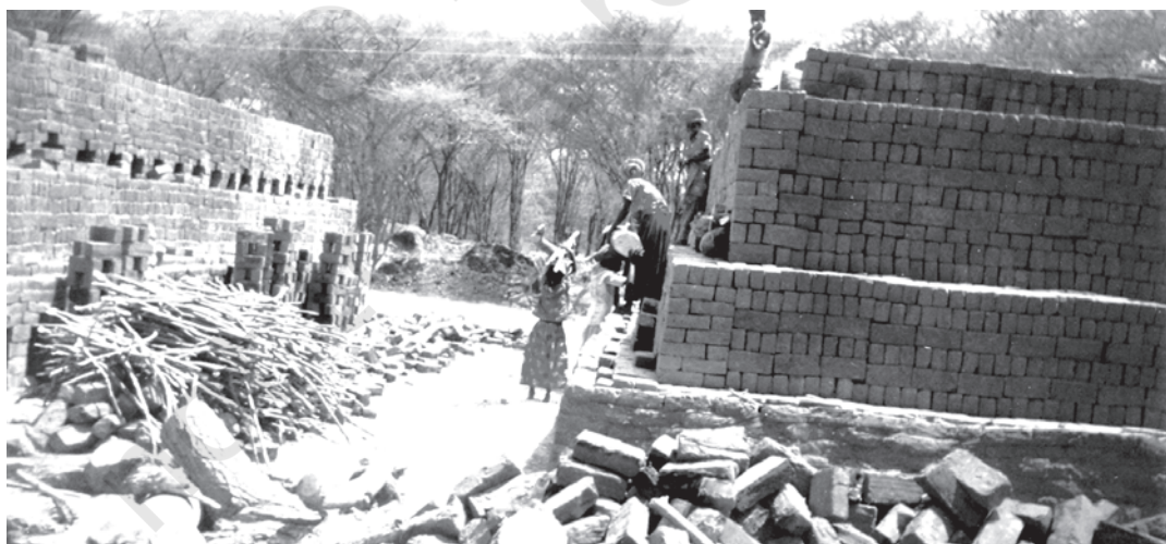
Fig. 5.6 School dropouts give way to child labour: a loss to human capital

Though literacy rates for both — adults as well as youth — have increased, still the absolute number of illiterates in India is as much as India's population was at the time of independence. In 1950, when the Constitution of India was passed by the Constituent Assembly, it was noted in