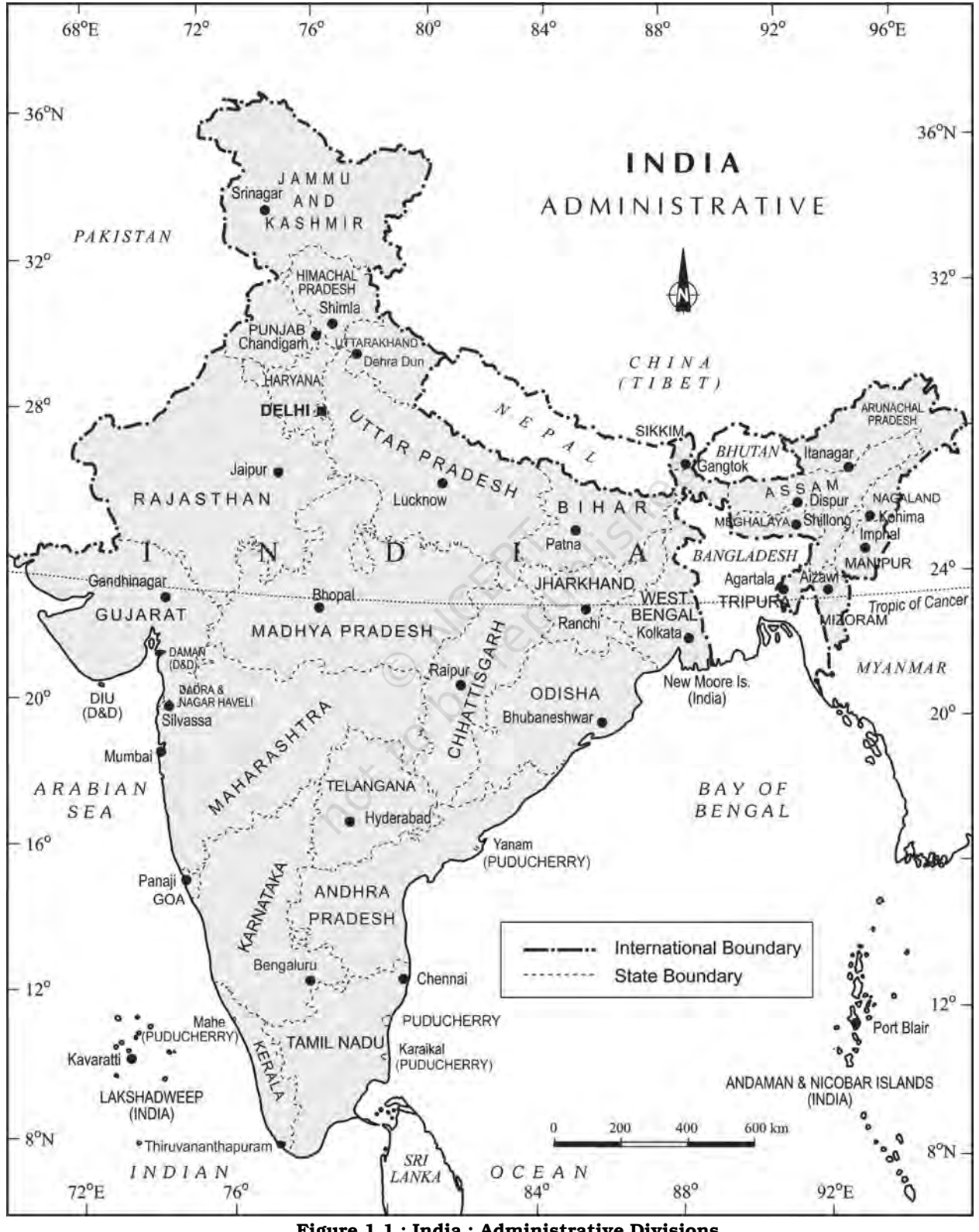
Figure 1.1 : India : Administrative Divisions

Note: Telangana became the 29th state of India in June 2014.