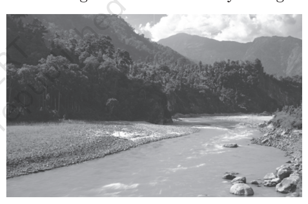
Figure 3.1: A River in the Mountainous Region

2006) in this class. Can you, then, explain the reason for water flowing from one direction to the other? Why do the rivers originating from the Himalayas in the northern India and the Western Ghat in the southern India flow towards the east and discharge their waters in the Bay of Bengal?