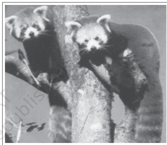
Figure 16.2 : Red Panda — an endangered species

It includes those species which are in danger of extinction. The IUCN publishes information about endangered species world-wide as the Red List of threatened species.