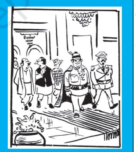
Must be from a backward nation. He talked about employment, education, health, shelter and not a word about the nuclear bomb!

Peace is often defined as the absence of war. The definition is simple but misleading. This is because war is usually equated with armed conflict between countries. However, what happened in Rwanda or Bosnia was not a war of this kind. Yet, it represented a