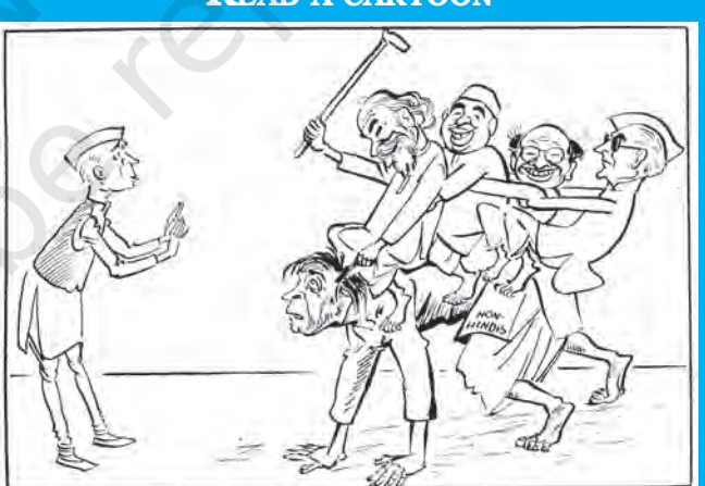
18 September 1949

During discussion on the national language in the Constituent Assembly, Nehru had to appeal to the Hindispeaking provinces to show greater tolerance towards others. **Don't spare me Shankar*, p.24*