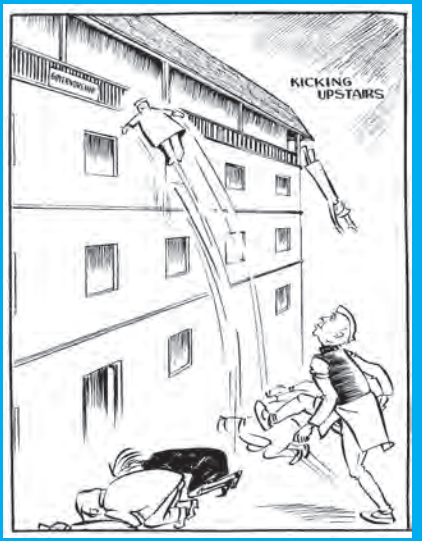
27 April 1952

"When Nehru was appointing governors, some were reluctant to quit ministerial chairs."