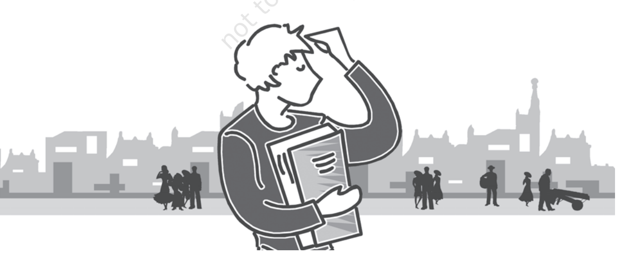
The Last Lesson/3

I jumped over the bench and sat down at my desk. Not till then, when I had got a little over my fright, did I see that our teacher had on his beautiful green coat, his frilled