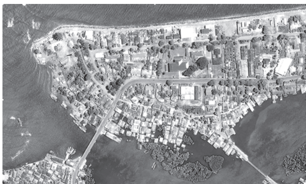
Band Aceh, June, 2004