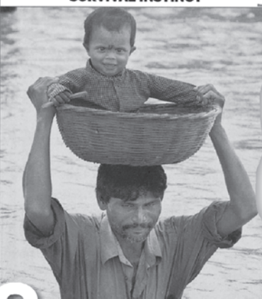
Water Woes : A father carries his son to safety as he wades through floodwater, after a three-day spell of heady rain in Dhantala village, near Siliguri

भाखडा से नर्मदा तक बांध से भी ऊंची है विस्थापन की समस्या