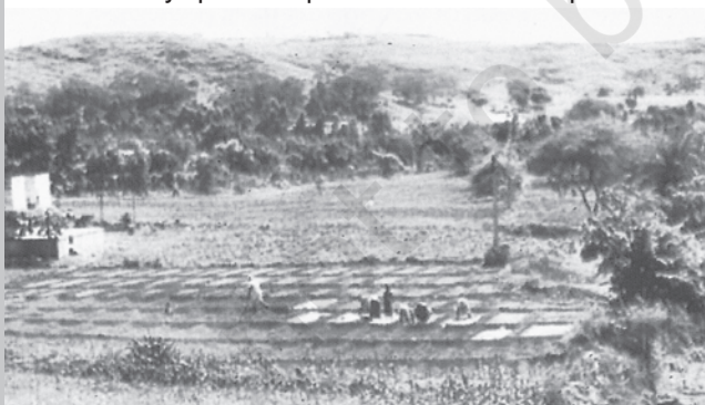
Ralegan Siddhi after mitigation approach

At present, water is adequate; agriculture is flourishing, though the use of fertilisers and pesticides is very high. The prosperity also brings the question of ability of the present generation to carry on the work after the leader of the movement who declared that, "The process of Ralegan's evolution to an ideal village will not stop. With changing times, people tend to evolve new ways. In future, Ralegan might present a different model to the country."