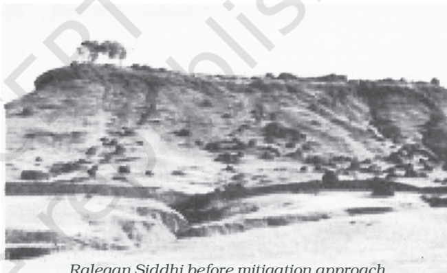
Ralegan Siddhi before mitigation approach

A Rs.22 lakh school building was constructed using only the resources of the village. No donations were taken. Money, if needed, was borrowed and paid back. The villagers took pride in this self-reliance. A new system of sharing labour grew out of this infusion of pride and voluntary spirit. People volunteered to help each other in agricultural operation. Landless labourers also