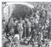
ALL WELL? There are more than 3,800 declarations or conventions on water, including 286 treaties

There have been more than 500 conflicts over water in the past century, but it's also an agent of cooperation