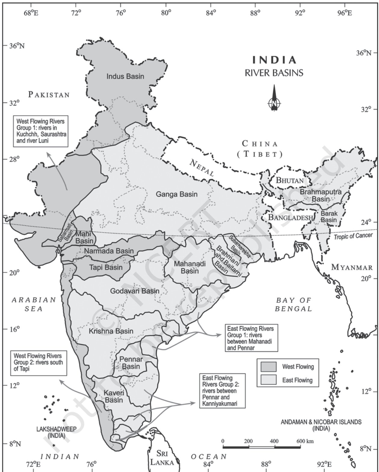
Fig. 6.1 : India – River Basins