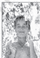
has been very difficult." In Europe, the report said, countries around the Atlantic are suffering from recurring droughts, while in the Mediterranean region water resources were being depleted by the boom in tourism and irrigated agriculture. In Australia, already the driest continent, salinity had become a major threat to a large proportion of crop farming areas, while in the US wide areas were using substantially more water than could be replenished. Even in Japan with its high rainfall, contamination of water supplies had become a serious issue.

and Inter-national River Accords. The water available at cords on water reached even by states that were in conflict over other matters like India and Pakistan, Israel and Jordan. Another example is that of the Northern Aral Sea, shared by Kazakhstan and Uzbekistan. It is being successfully restored after its surface has shrunk to less than half its original size as a result of a massive diversion of water to the Aral Sea basin. China, which has drained the two rivers feeding and devastated the surrounding environment, is now making drastic changes to its policies if they are to avoid the same fate as the world's poorest nations, ENVF said. The World Wildlife Fund (WWF) international organisation WWC said on Wednesday. In a survey of the situation across the industrialised world, it said many cities were already losing the battle to protect their water supplies. Local governments talked about conservation but failed to implement their pledges.