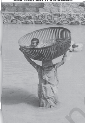
In the Times of Adversity : A woman carries her child to safety in the flooded Kudla village of Rajasthan's Barmer district