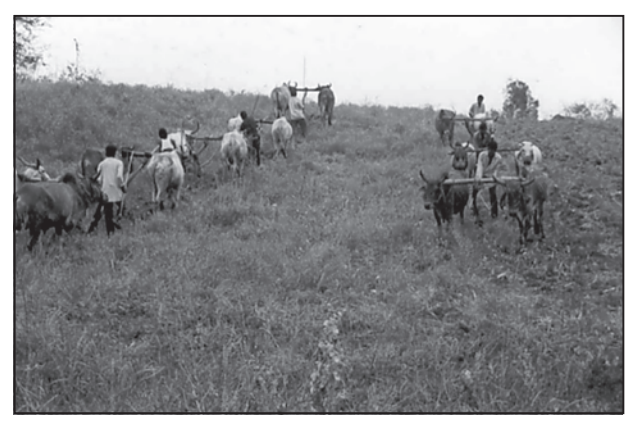
Fig. 12.5 : Community Participation for Land Leveling in Common Property Resources in Jhabua (ASA, 2004)