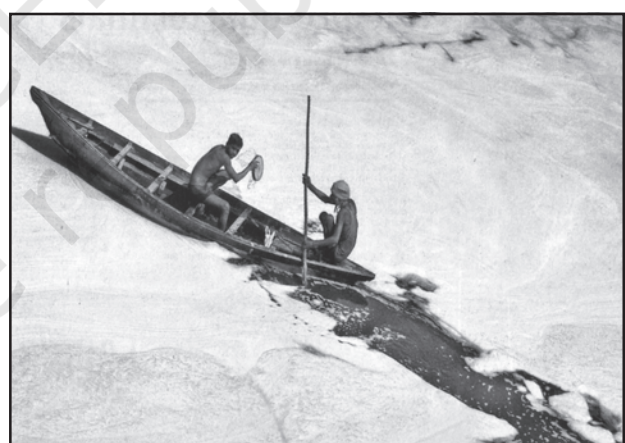
Fig.12.1 : Cutting Through Effluent : Rowing through a pervasive layer of foam on the heavily polluted Yamuna on the outskirts of New Delhi

Indiscriminate use of water by increasing population and industrial expansion has led degradation of the quality of water considerably. Surface water available from rivers, canals, lakes, etc. is never pure. It contains small quantities of suspended particles, organic and inorganic substances. When concentration of these substances increases, the water becomes polluted, and hence becomes unfit for use. In such a situation, the self-purifying capacity of water is unable to purify the water.