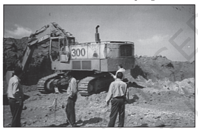
Fig. 12.2 : Noise monitoring at Panchpatmalai Bauxite Mine

The main sources of noise pollution are various factories, mechanised construction and demolition works, automobiles and aircraft, etc. There may be added periodical but polluting noise from sirens, loudspeakers used in various festivals, programmes