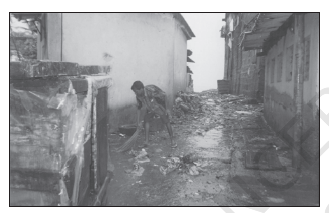
Fig. 12.3: A view of urban waste in Mahim, Mumbai