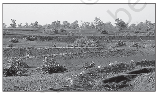
Fig. 12.4 : Trees planted on Common Property Resources in Jhabua

An interesting aspect of this experience is that before the community embarked upon the process of management of the pasture, there was encroachment on this land by a villager from an adjoining village. The villagers called the tehsildar to ascertain the rights of the common land. The ensuing conflict was tackled by the villagers by offering to make the defaulter encroaching on the CPR a member of their user group and sharing the benefits of greening the common lands/pastures. (See the section on CPR in chapter 'Land Resources and Agriculture').