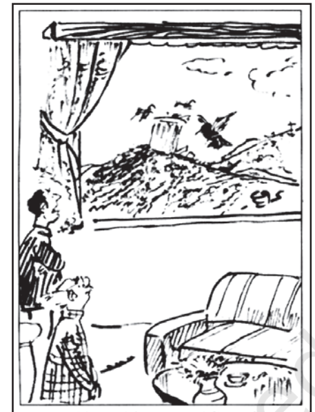
I moved into this second floor from the first to get a view of the sea and the garbage has piled up to this level obstructing the view.

Urban waste disposal is a serious problem in India. In metropolitan cities like Mumbai, Kolkata, Chennai, Bengaluru, etc., about 90 per cent of the solid waste is collected and disposed. But in most of other cities and towns