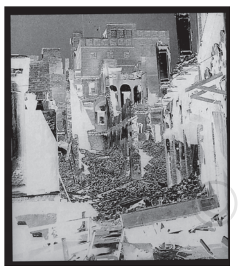
Fig. 15.2 Images of desolation and destruction continued to haunt members of the Constituent Assembly.

From your political science textbooks you know what the Constitution of India is, and you have seen how it has worked over the decades since Independence. This chapter will introduce you to the history that lies behind the Constitution, and the intense debates that were part of its making. If we try and hear the voices within the Constituent Assembly, we get an idea of the process through which the Constitution was framed and the vision of the new nation formulated.