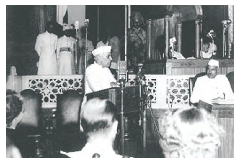
sudden death or the squeezing of opportunities on the one side, and a forcible tearing away from their age-old roots on the other. Millions of refugees were on the move, Muslims into East and West Pakistan, Hindus and Sikhs into West Bengal and the eastern half of the Punjab. Many perished before they reached their destination.

Another, and scarcely less serious, problem faced by the new nation was that of the princely states. During the period of the Raj, approximately one-third of the area of the subcontinent was under the control of nawabs and maharajas who owed allegiance to the British Crown, but were otherwise left mostly free to rule – or misrule – their territory as they wished. When the British left India, the constitutional status of these princes remained ambiguous. As one contemporary observer remarked, some maharajas now began "to luxuriate in wild dreams of independent power in an India of many partitions".