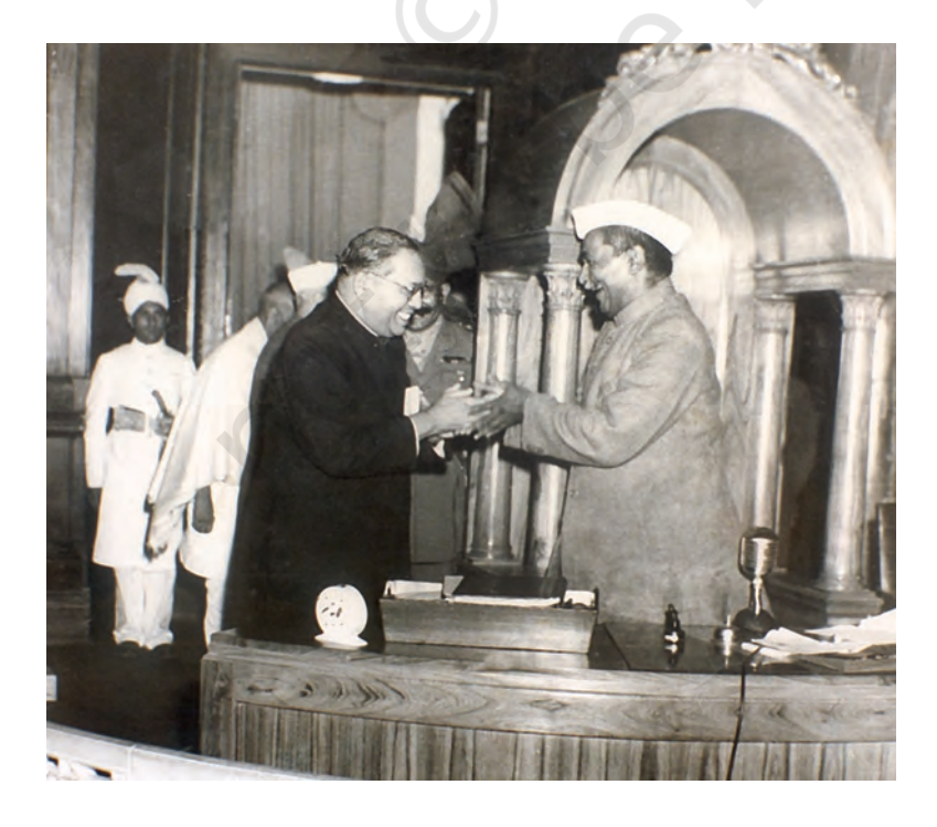
Fig. 15. 9 B. R. Ambedkar and Rajendra Prasad greeting each other at the time of the handing over of the Constitution

The Constituent Assembly debates help us understand the many conflicting voices that had to be negotiated in framing the Constitution, and the many demands that were articulated. They tell us about the ideals that were invoked and the principles that the makers of the Constitution operated with. But in reading these debates we need to be aware that the ideals invoked were very often re-worked according to what seemed appropriate within a context. At times the members of the Assembly also changed their ideas as the debate unfolded over three years. Hearing others argue, some members rethought their positions, opening their minds to contrary views, while others changed their views in reaction to the events around.