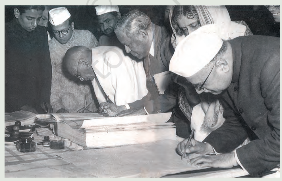
Fig. 15.1 The Constitution was signed in December 1949 after three years of debate.

The Constitution of India was framed between December 1946 and November 1949. During this time its drafts were discussed clause by clause in the Constituent Assembly of India. In all, the Assembly