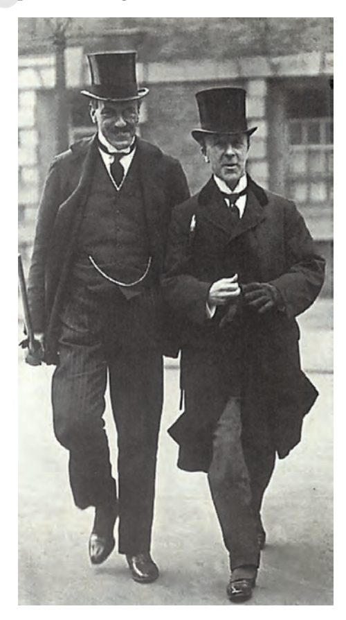
Fig. 15.7 Edwin Montague (left) was the author of the Montague-Chelmsford Reforms of 1919 which allowed some form of representation in provincial legislative assemblies.

◆ Why does the speaker in Source 2 think that the Constituent Assembly was under the shadow of British guns?