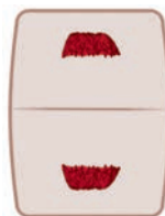
Fig. 6.2 Cytokinesis