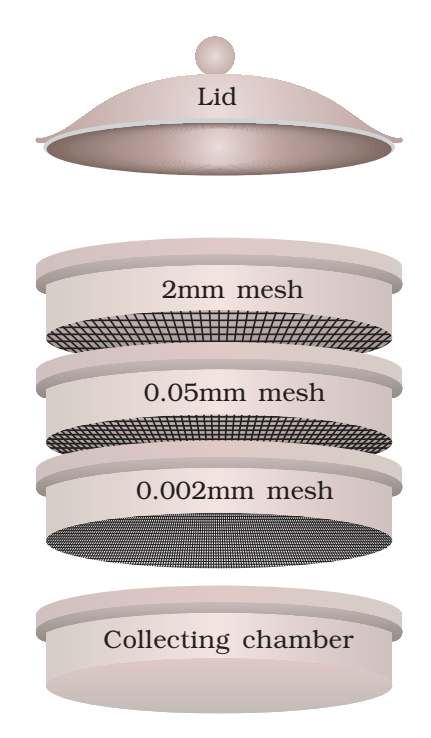
Fig.15.2 Sieve set

(v) Weigh the soil fractions viz-sand, silt and clay collected in the 3 compartments