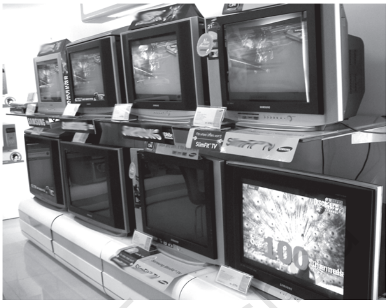
A television showroom

In 1991 there was one state controlled TV channel Doordarshan in India. By 1998 there were almost 70 channels. Privately run satellite channels have multiplied rapidly since the mid-1990s. While Doordarshan broadcasts over 20 channels there were some 40 private television networks broadcasting in 2000. The staggering growth of private satellite television has been one of the defining developments of contemporary India. In 2002, 134 million individuals watched satellite TV on an average every week. This number went up to 190 million in