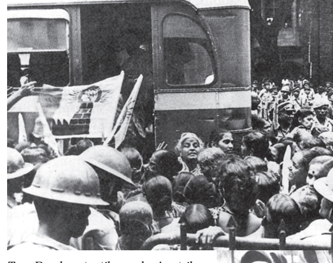
Top: Bombay textile worker's strike 1981-82

Right: Women workers at a Union Demonstration, Arwal, Bihar 1987