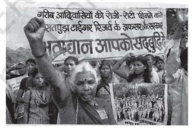
Struggles of the tribals continue

Different tribal groups spread across the country may share common issues. But the distinctions between them are equally significant. Many of the tribal movements have been largely located in the so called 'tribal belt' in middle India, such as the Santhals, Hos, Oraons, Mundas in Chota Nagpur and the Santhal Parganas. The region constitutes the main part of what has come to be called Jharkhand. We will not be able to go into any detailed account of the different movements. We take Jharkhand as an example of a tribal movement with a history that goes back a hundred years. We also briefly touch on the specificity of the tribal movements in the North East but fail to