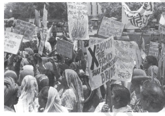
Struggle against dowry

Apart from organisational changes, there were new issues that were focussed upon. For instance, violence against women. Over the years, there have been numerous campaigns that have been taken up. You may have noticed that application for school forms have both father's and mother's names. This was not always true. Likewise, important legal changes have taken place thanks to the campaign by the women's movement. Issues of land rights, employment have been fought alongside rights against sexual harassment and dowry.