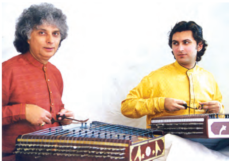
Pt. Shiv Kumar Sharma and his son Rahul Sharma

In some families, the food habits or style of dressing of some of the members are similar. Some members of a family may not like some dish or the whole family may be fond of kheer (rice pudding). In the same manner, many children follow the occupations of their parents or relatives like the son/daughter of a sports person wants to follow the same sport. The children of singers, artists, actors, builders, goldsmiths or doctors may follow the footsteps of their parents or they may want to take up some other work.