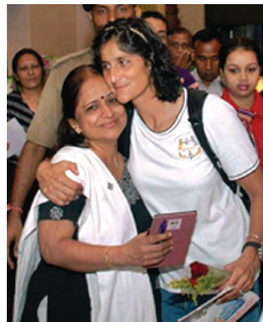
Sunita Williams with her relatives