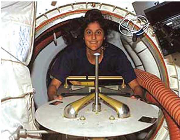
Sunita Williams coming out of spaceship

As Sunita Williams ended her space journey in United States, her relatives back home in Gujarat could not stop their tears of joy. 'She has landed safely by the grace of God. It is a moment of great joy for all of us,' said Sunita's uncle. Her relatives came out on the streets and danced till daybreak, bursting crackers and beating drums!